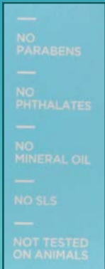
Printed on Product Boxes